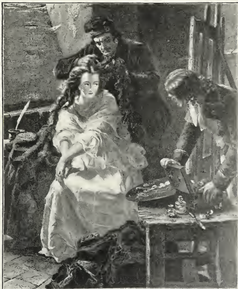
LAST TOILETTE OF MARIE ANTOINETTE.